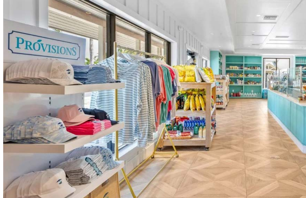
Provisions – Opened July 2024