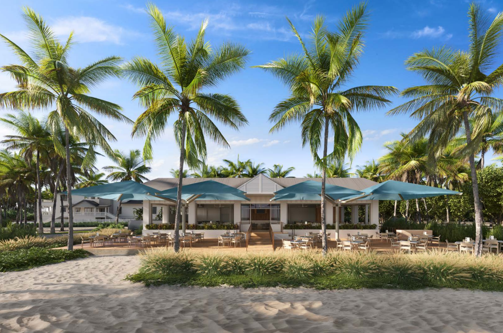
Beach House - Under Construction w/ Summer Completion