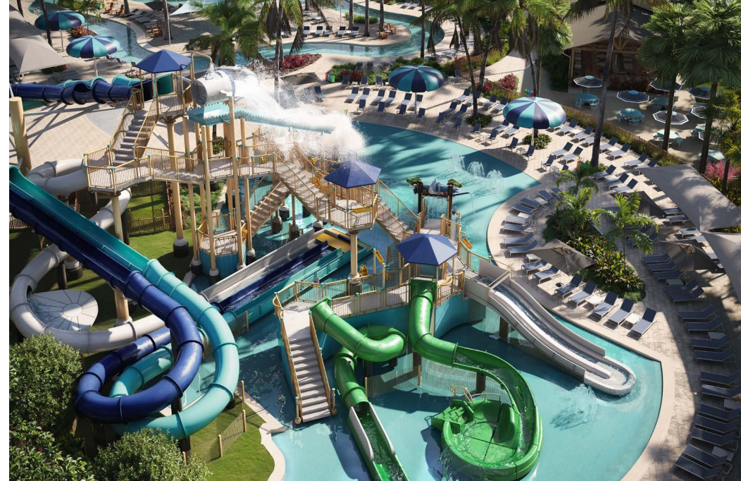
Captiva Landing - Under Construction w/ End of Year Completion