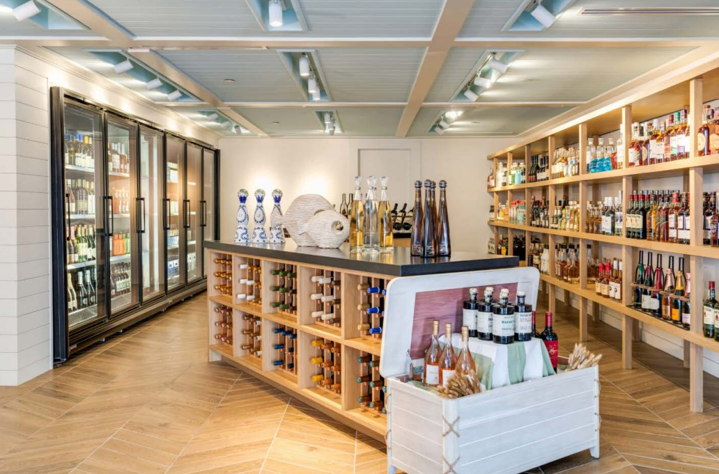
South Seas Spirits – Now Open