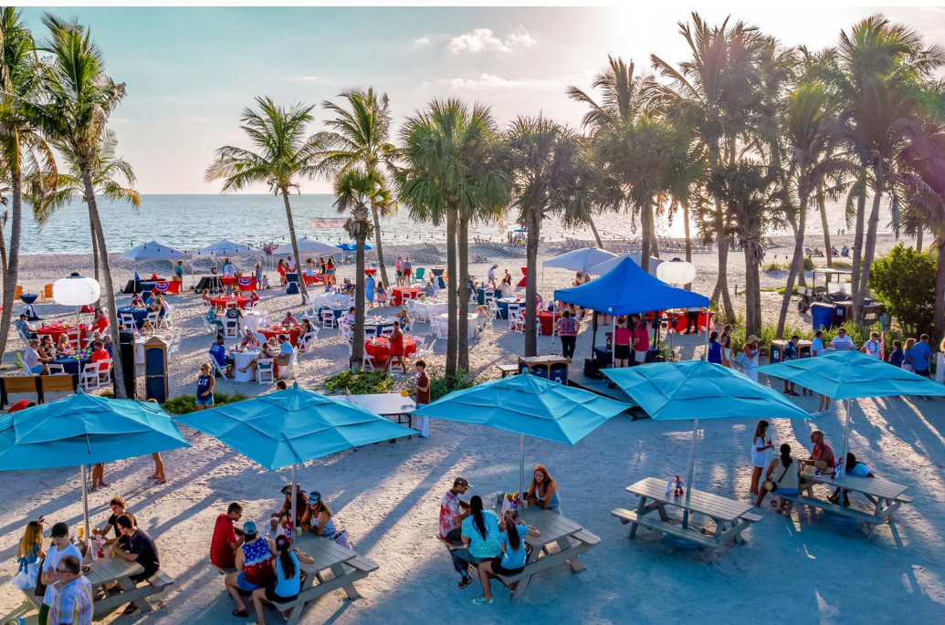
Sunset Beach 4th of July Celebration