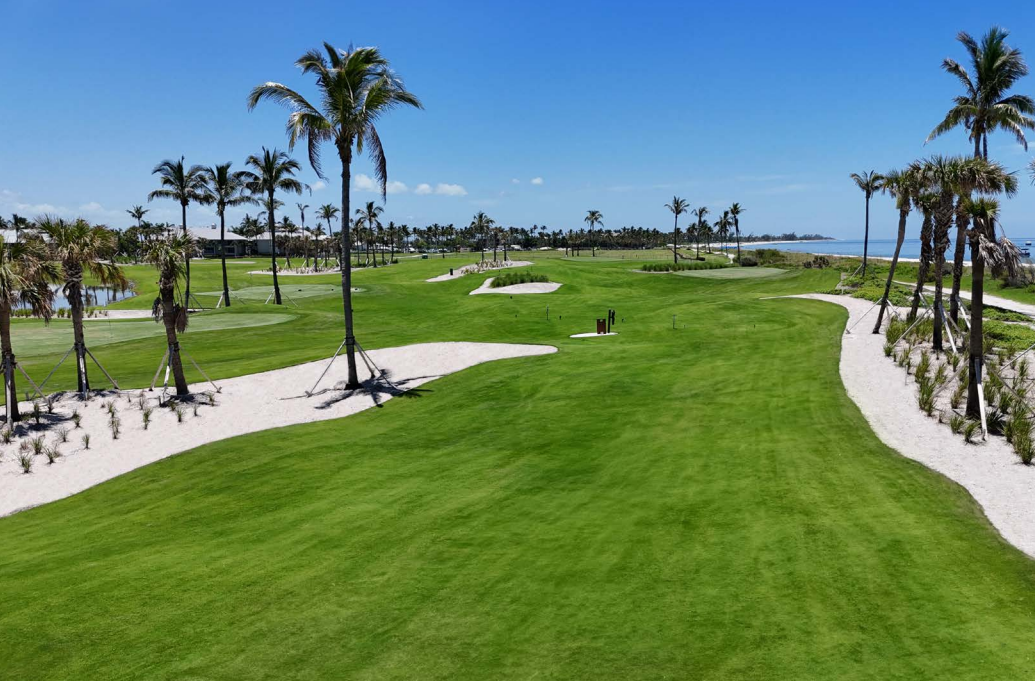
The Clutch Golf Course