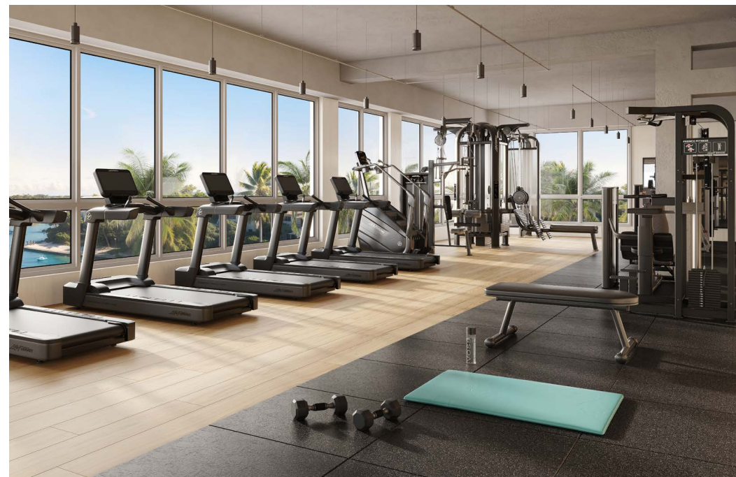
South Seas Spa & Fitness - In Permitting