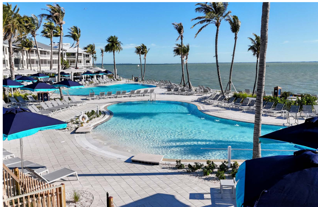
Bayview Pool Complex