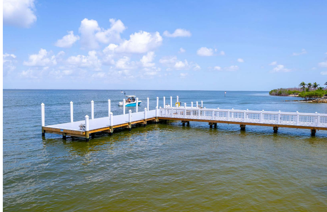
Bayview Fishing Pier