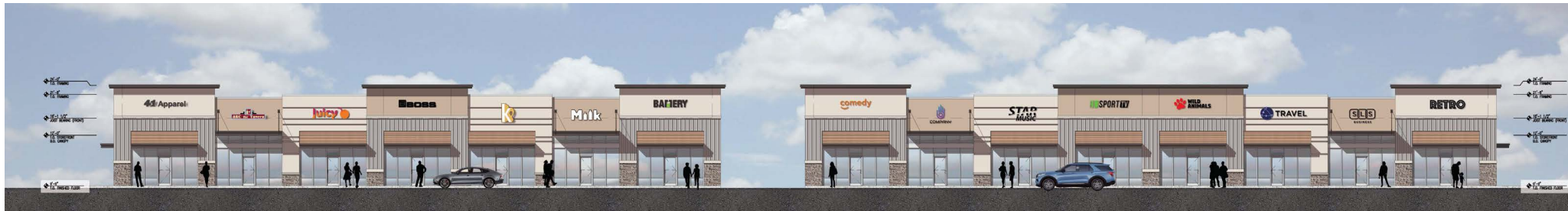
RETAIL BUILDING C & D FRONT ELEVATION