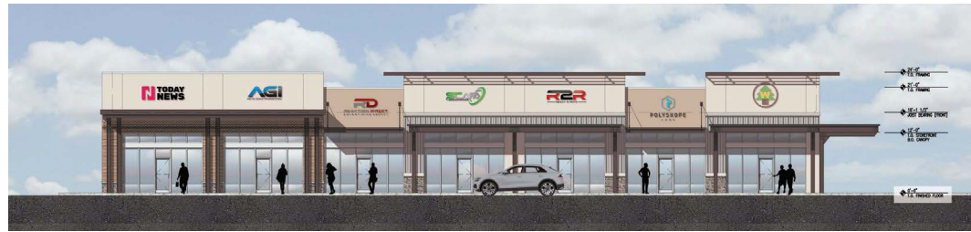
RETAIL BUILDING A FRONT ELEVATION