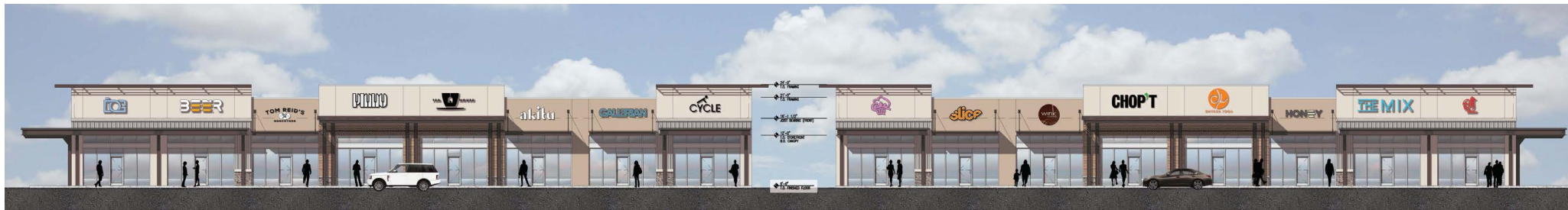
RETAIL BUILDING E & F FRONT ELEVATION

Disclaimer: The information contained in this brochure is provided for general informational purposes only. The estimated rentable area of the space is approximate and subject to verification. While every effort has been made to ensure the accuracy of the information presented, neither the landlord, property manager, nor their agents make any representation or warranty as to the actual rentable area. Prospective tenants are encouraged to independently verify the actual dimensions and square footage of the space prior to entering into any lease agreement. All information is subject to change without notice.