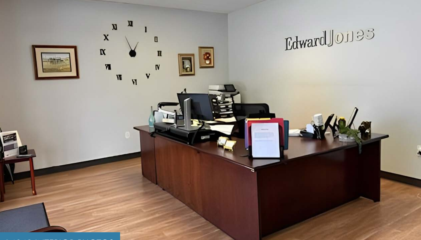
14842 INTERIOR PHOTOS