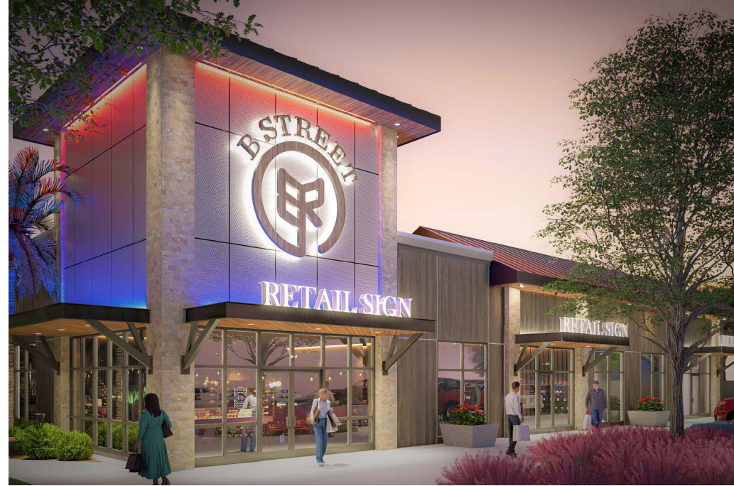
*PROPOSED RENDERINGS, SUBJECT TO CHANGE

We invite you to join us in creating a vibrant atmosphere filled with art, cuisine, music, shopping, fitness and more.