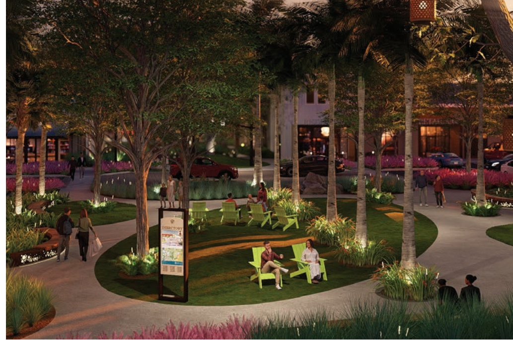
*PROPOSED RENDERINGS, SUBJECT TO CHANGE

We invite you to join us in creating a vibrant atmosphere filled with art, cuisine, music, shopping, fitness and more.