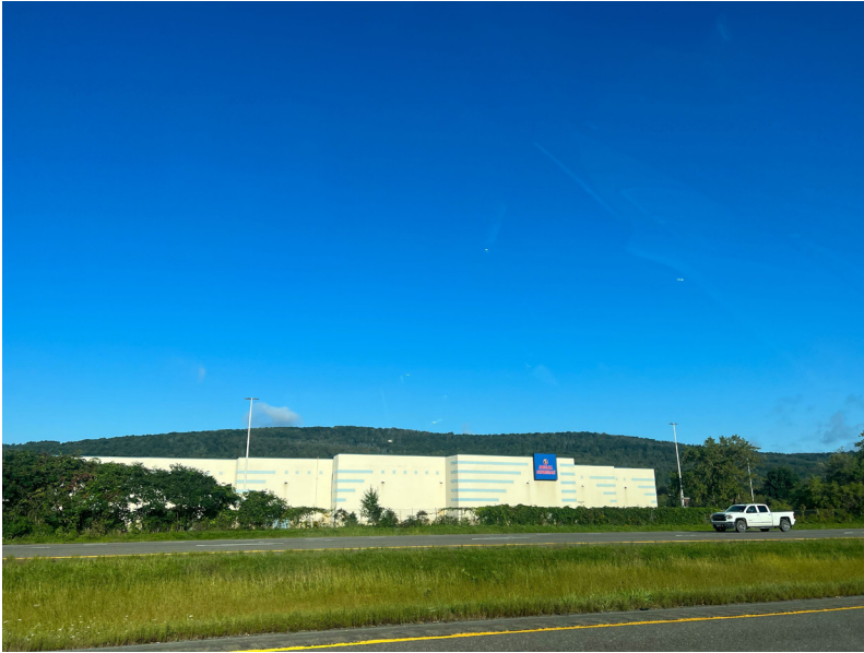
I-81 Highway Visibility