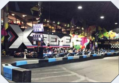
XTREME ACTION PARK TEAM BUILDING January 2017 Fort Lauderdale | Florida