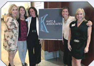
CAROLINAS ICSC KATZ COCKTAIL PARTY March 2017 BLT Steak Charlotte | North Carolina