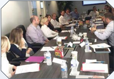
KATZ BROKER SUMMIT January 2017 Boca Raton | Florida