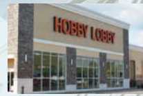
St. John's | FL St. Cloud | FL Dania Pointe | FL Lake Park | FL Daytona Beach | FL Pines City Center Pembroke Pines | FL Sunset Point Clearwater | FL