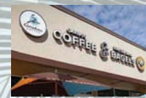
Del Prado Cape Coral | FL Pine Island Cape Coral | FL