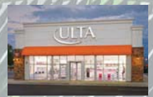
St. Cloud | FL Plant City | FL Panama City | FL Memphis | TN