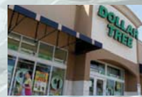
Naples | FL